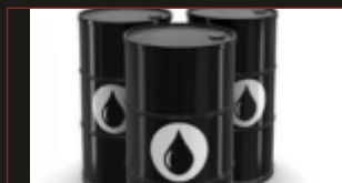
HIGH SPEED DIESEL EURO 4 GRADE (GASOLINE)