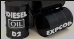
DIESEL GAS D2 OIL GOST 305-82