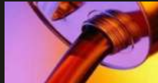
DIESEL GAS OIL ULTRA-LOW SULPHUR DIESEL 50 PPM/ EN590