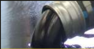
CST-180 FUEL OIL