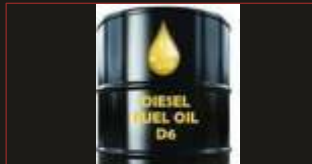
D6 FUEL OIL