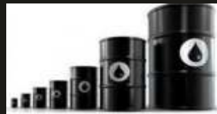
HSD2GASOILL-0.2-62GOST305-82 AGO (AUTOMOTIVE GASOIL)