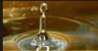
GASOLINE 93 OCTANE