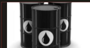
EASTERN SIBERIA PACIFIC OCEAN CRUDE OIL (ESPO)