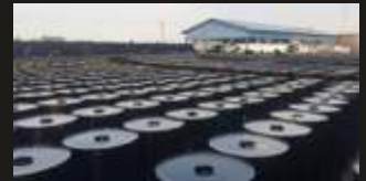
BITUMEN / PETROLEUM ASPHALT