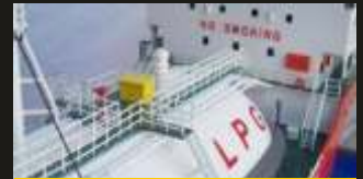
LIQUEFIED PETROLEUM GAS GOST 20448-90 (LPG)