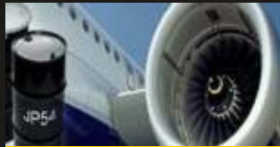
AVIATION KEROSENE COLONIAL GRADE 54 JET FUEL (JP54)