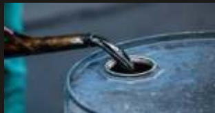
IFO380 (MARINE OIL) CST 280 & CST 180