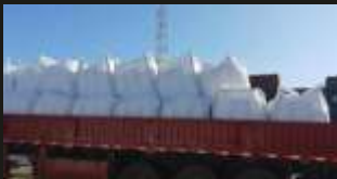
UREA 46% PRILLED & GRANULAR (RUSSIAN ORIGIN)