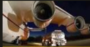
JET FUEL JPA1 (AVIATION KEROSENE COLONIAL GRADE A1)