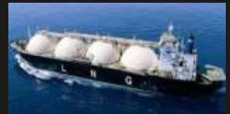
RUSSIA LIQUEFIED NATURAL GAS (LNG)