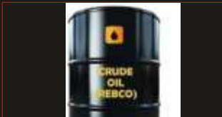
RUSSIA EXPORT BLEND CRUDE OIL GOST 51858