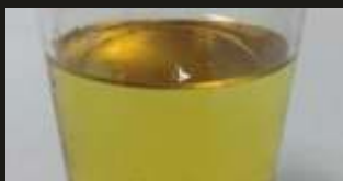
BASE OIL SN150 (VIRGIN) SN500 (VIRGIN)